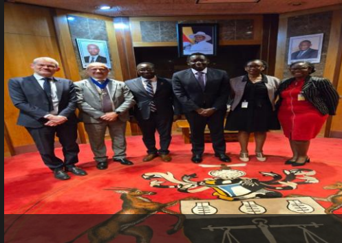
Fiabci World Delegation ,The Governor Bank Of Uganda and AREA BOARD Members