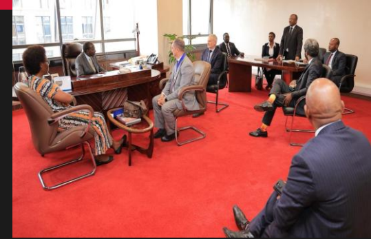
Technical discussions with Minister Of Finance Matia Kasaija, Minister Of Finance, Hon Judith Nabakooba Ministry Of Lands, Housing, And Urban Development Of Uganda,