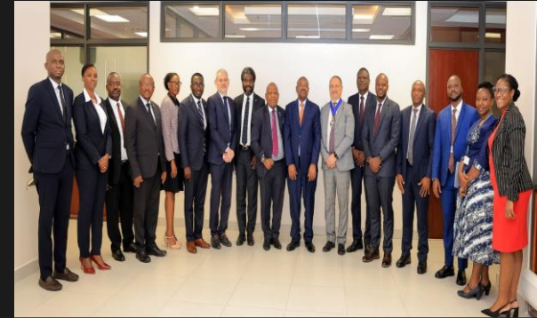
A photo group taken after Technical discussions at Ministry of Finance