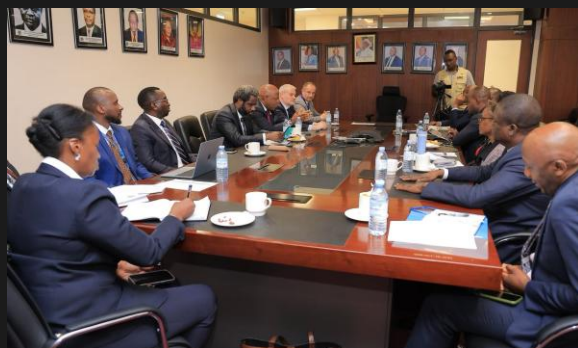
High-level boardroom session with Ugandan officials