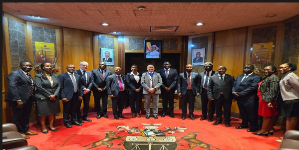
Bank of Uganda Governor Michael Atingi-Ego, G with Full delegation at Bank of Uganda official chambers