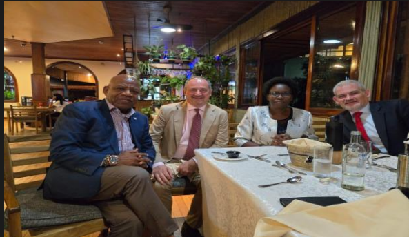
Diplomatic dinner — bilateral housing reform talks