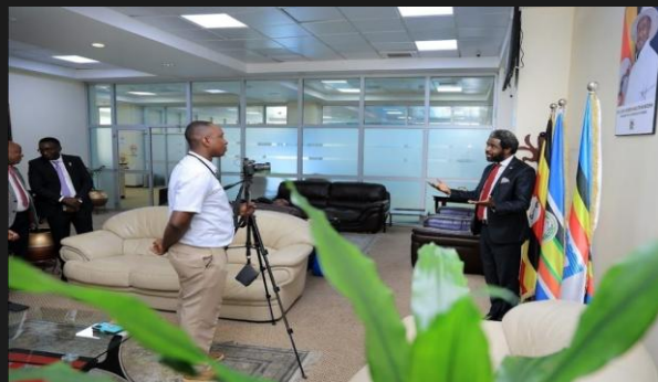
FIABCI President Nigeria at an Interview on arrival at the Entebbe airport