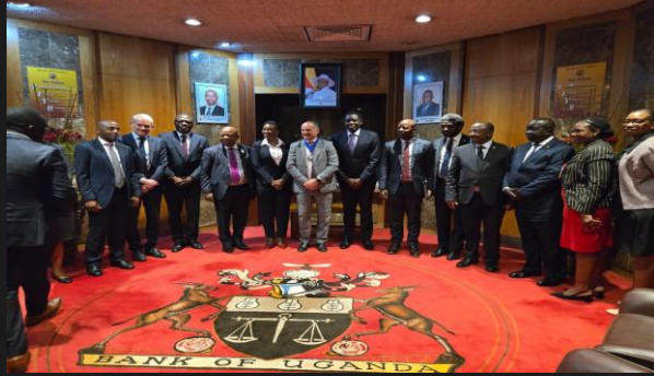
A photo group taken after Technical discussions at Bank of Uganda